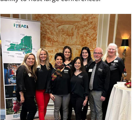
Hosted a client luncheon for meeting planners and receptive tour operators at the Cornell Club in NYC as part of our Spring Sales mission with the Retreat to Ithaca tourism partners.

Hosted MPI Upstate NY Fall Focus Innovation in Ithaca Conference. This major community collaboration brought dozens of meeting planners to Ithaca, showcasing the fully electric IDCC and our community's ability to host large conferences.