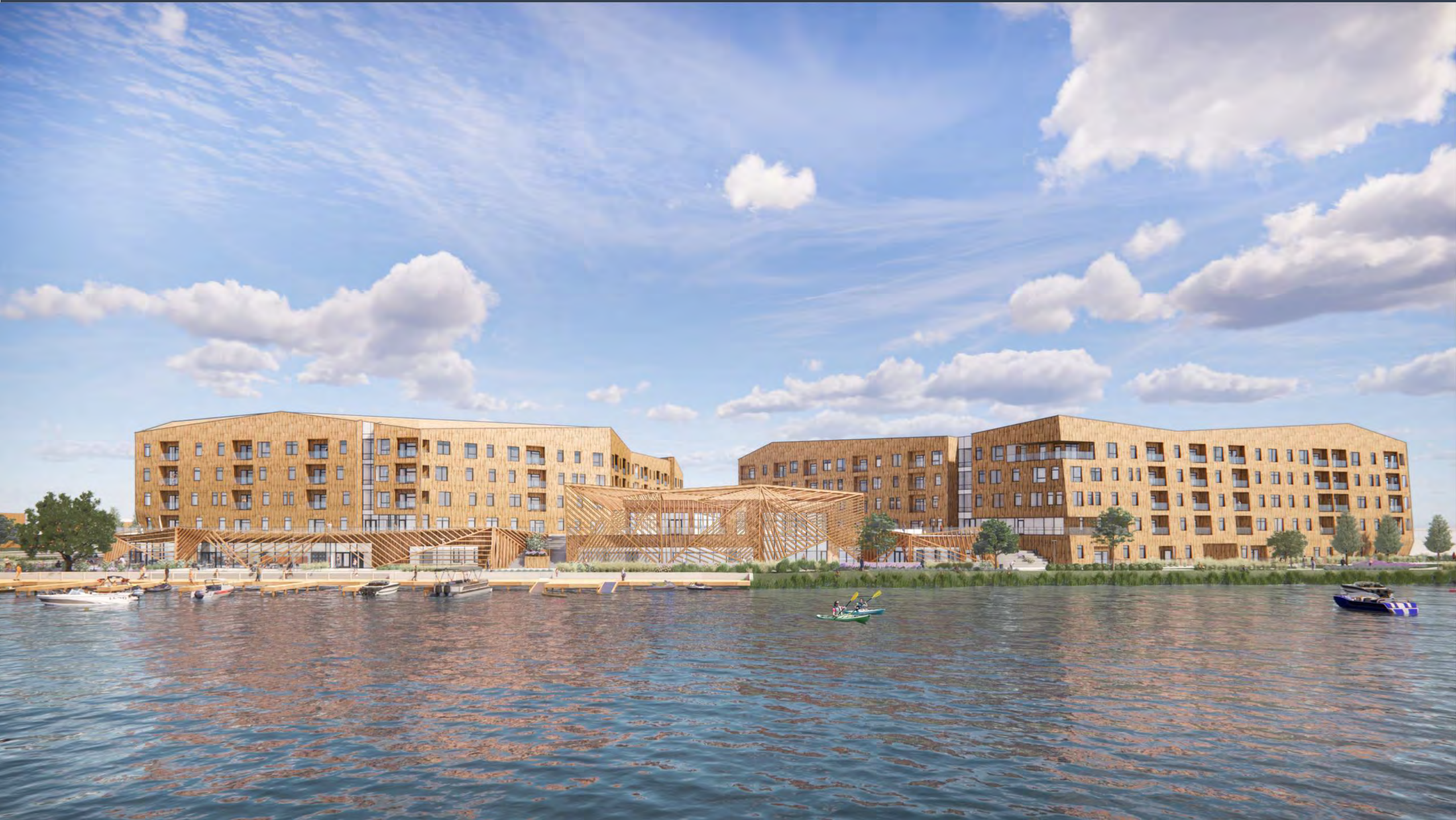
Waters Edge Conceptual Renderings - View From West