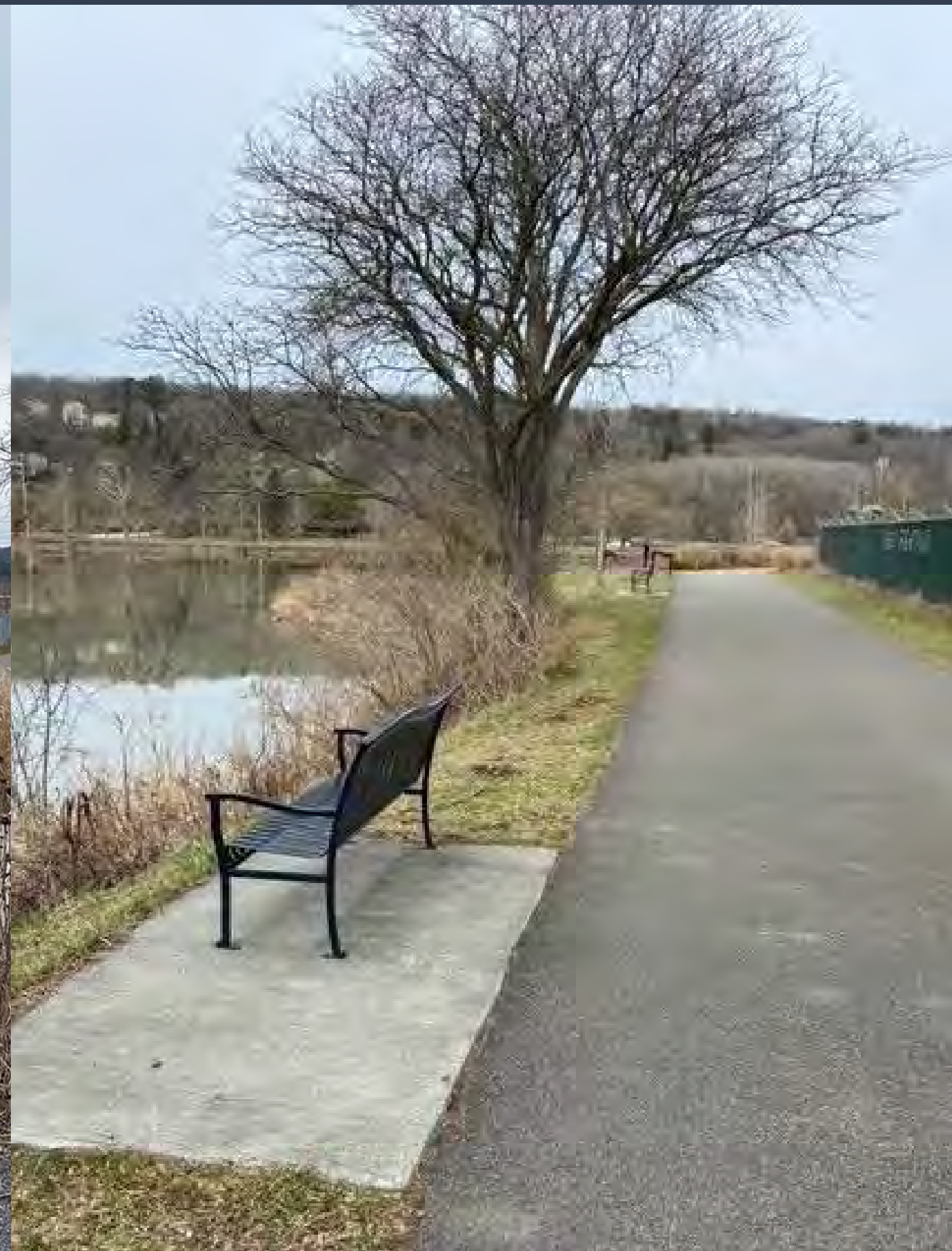
Waters Edge Existing Site Conditions - Waterfront Trail