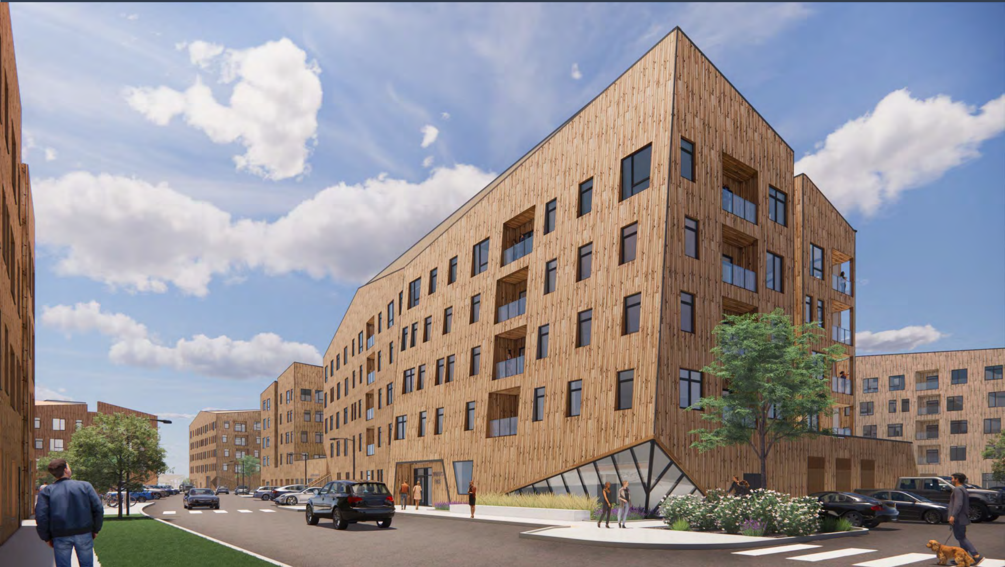
Waters Edge Conceptual Renderings - Third Street Entrance