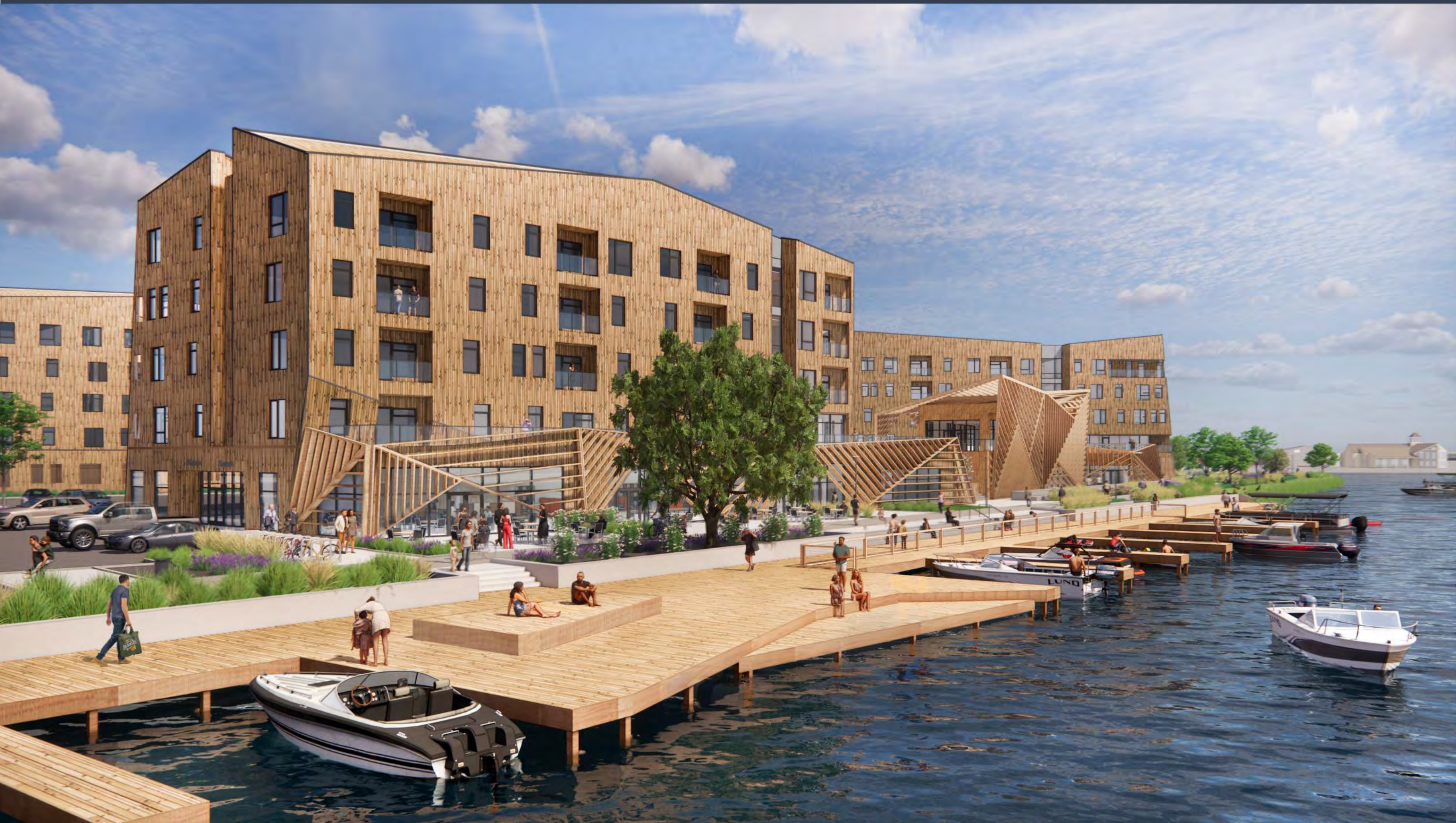
Waters Edge Conceptual Renderings - View From North West