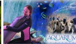
Aquarium of Niagara