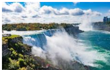
Niagara Falls, NY