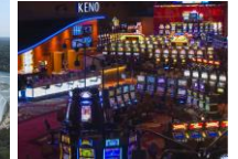
Seneca Niagara Casino

Niagara Falls is known for the vast falls that straddle the Canadian border. Enjoy the view from Cave of the Winds, Maid of the Mist, or the Observation Tower that juts out over Niagara Gorge at Prospect Point, in Niagara Falls State Park, for a view of all three waterfalls. Trails from the Niagara Gorge Discovery Center will take you to other viewpoints. The Aquarium of Niagara houses Humboldt penguins, sea lions, and seals, among other marine animals. Goat Island, the oldest State Park in the United States, offers spectacular views of the falls. A trolley makes a circular route from the Niagara Discovery Center to Goat Island. For those interested in trying your luck, the Seneca Niagara Casino is only a four-block walk from the falls!