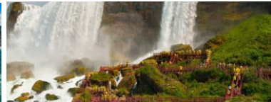
Cave of the Winds