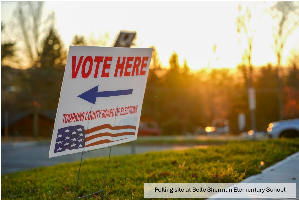
Polling site at Belle Sherman Elementary School

Poll workers in Groton receive instructions on securely emptying ballots from a machine that has filled up. This is done in a bipartisan manner, and the ballots are sealed into a ballot bag to be returned to the Board of Elections.