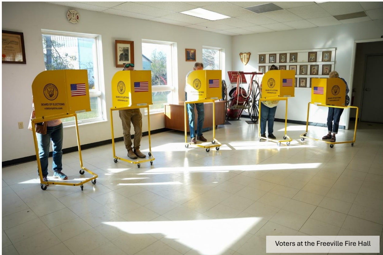
Voters at the Freeville Fire Hall