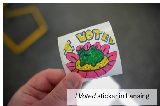
I Voted sticker in Lansing

7:05pm – Two calls come in from the Robert Purcell Community Center polling site about lines being long. Staff internally discuss that lines may be long because many voters require affidavit