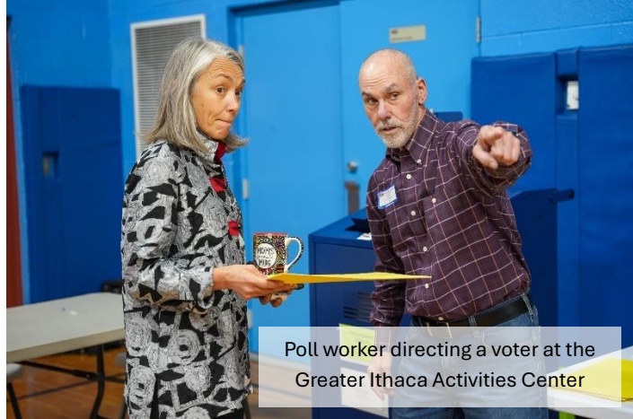
Poll worker directing a voter at the Greater Ithaca Activities Center

10:00am – 12:00pm: As poll sites see the first wave of voters wane, calls and activity at the Board of Elections slow. Because of the high turnout for this election, affidavit ballots continue to be requested by poll sites and used throughout the County. People who have registered to vote Online and are missing a signature in the local files, or those who have a change of address, a name change, or are residents of a