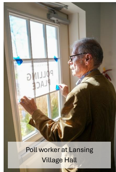
Poll worker at Lansing Village Hall

6:20am – A steady stream of calls from poll site managers are addressed by staff at the Board of Elections. Routine calls include machine troubleshooting and ballot printing questions. If you've ever had a printer, you know the challenges. Five Board of Elections technicians are already in the field, dispatched by a central technician to address any last-minute machine issues and support poll workers.