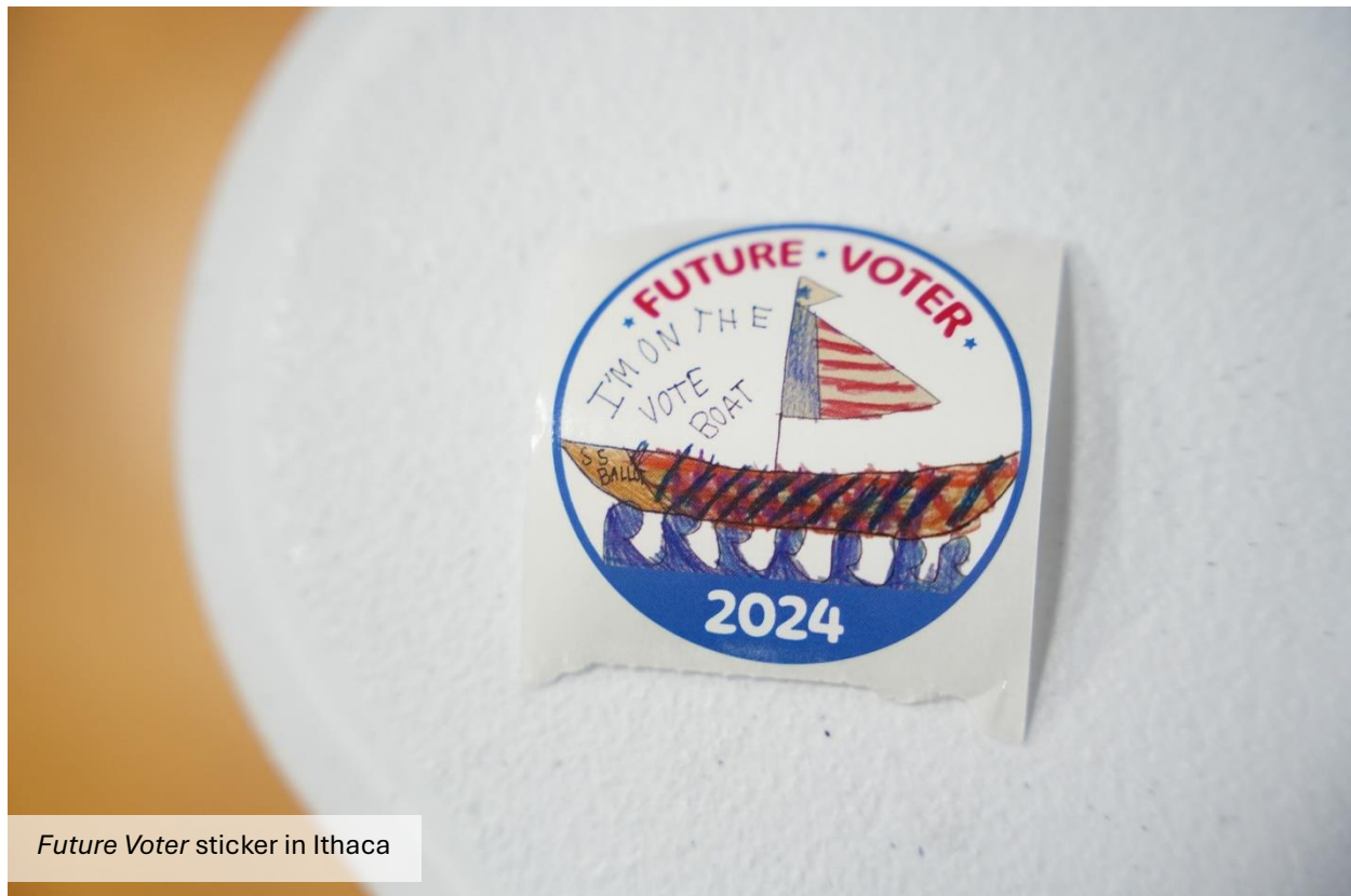
Future Voter sticker in Ithaca

The day was considered by all to be a success at the Tompkins County Board of Elections with lessons learned for future elections.