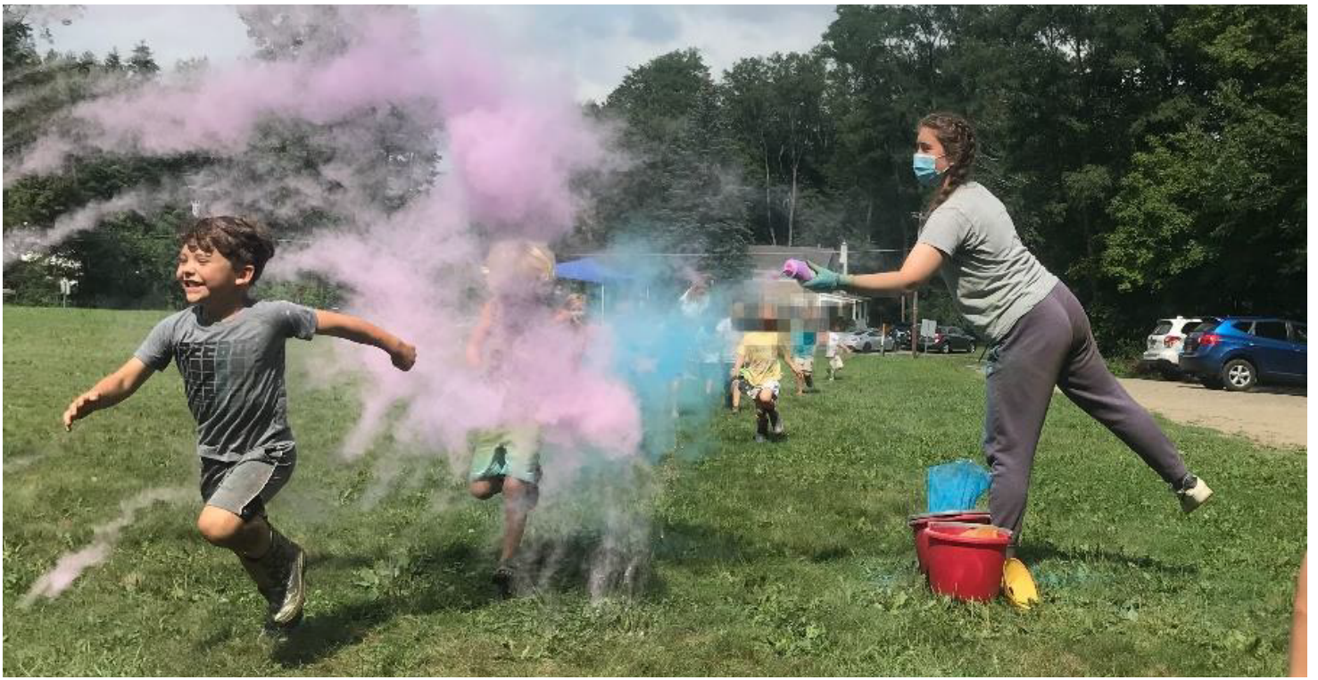
Camp Coddington Participants