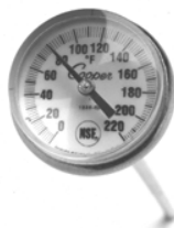
Range 0 °F to 220 °F