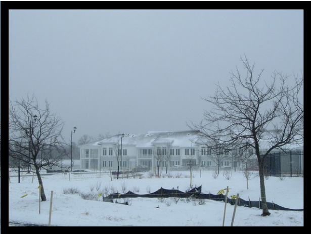
1. KENDAL AT ITHACA