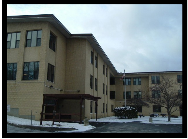
2. CAYUGA RIDGE EXTENDED CARE