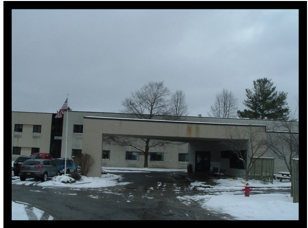
4. GROTON COMMUNITY HEALTH CARE CENTER