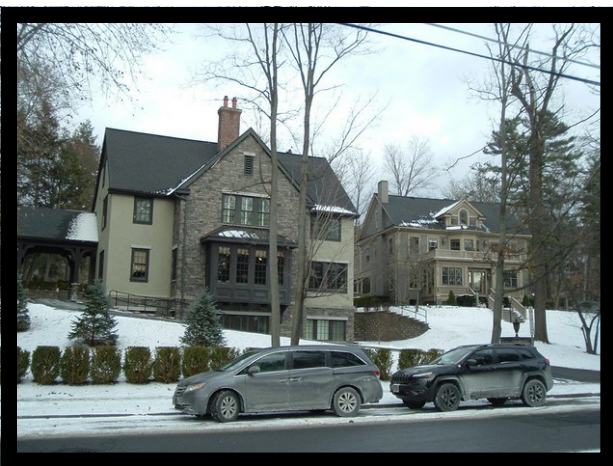
1. BRIDGES CORNELL HEIGHTS