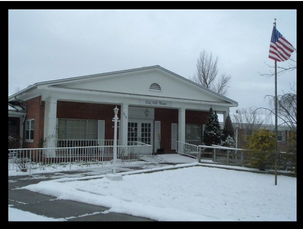
3. OAK HILL MANOR