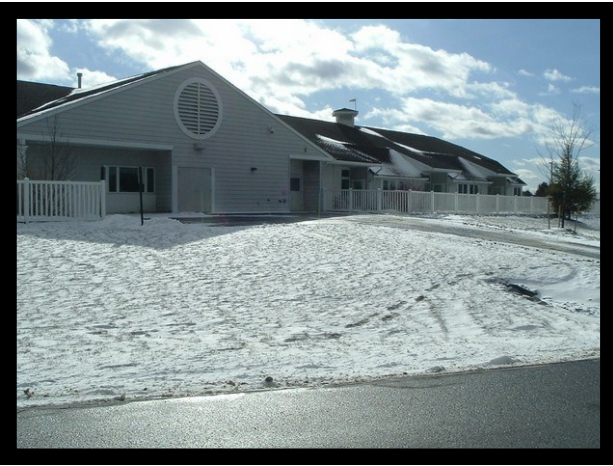
2. KENDAL AT ITHACA ASSISTED LIVING