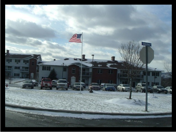
2. LONGVIEW INDEPENDENT LIVING