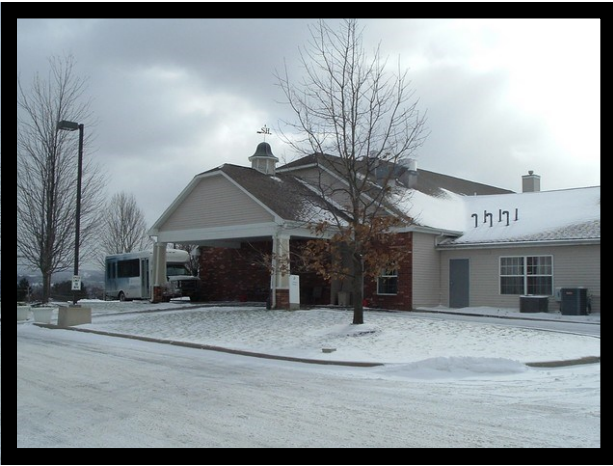
1. BROOKDALE ITHACA (ASSISTED LIVING)