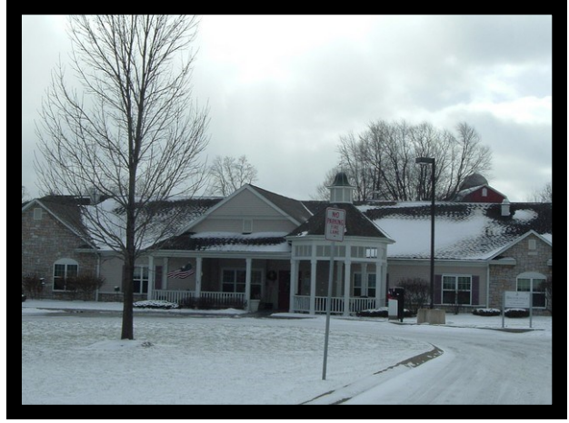
1. BROOKDALE ITHACA (MEMORY CARE)