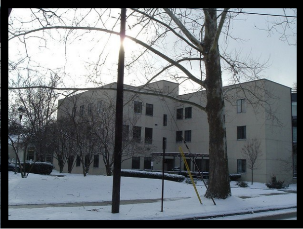
1. BEECHTREE CARE CENTER