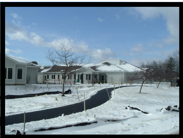
5. KENDAL AT ITHACA