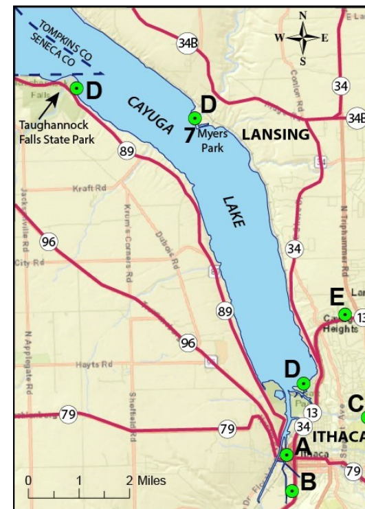
Figure 2—Location of places to buy or rent paddling craft