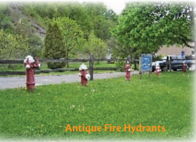
Antique Fire Hydrants

3 Conger Boulevard – The Groton Town Building is located at #101. Along the main hallway inside the Town Hall are late 19 th -century photographs of Groton. Displayed in the Town Clerk's office is an early 20 th -century handmade wedding dress. On the hillside beyond the building is Bank Swallow Park , an active nesting place in the warmer months