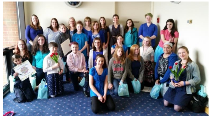
Going to Sister Friend, an first time experience all of these girls shared.

What does going to a restaurant with table cloths for the first time, building a wall, and meeting new friends from different communities have in common? Ask the 30 girls who are in "Girls Ventures"! Thanks to the City Federation of Women's Organizations, Women's Building Community Grants, the "Girls Ventures Group" was formed. This program targets low income girls who may have low self-esteem, few career aspirations, and a narrow view of the world. The participants are from Groton, Lansing, Dryden, Enfield, Caroline, & the Town of Ithaca. The program is designed to empower young women, build confidence, improve self-image, expand physical ability, and perceptions of "women's work". Some of the activities include visiting Seneca Falls Women's Rights Museum, going to Sister Friend, canoeing, high ropes course, carpentry for women course by Hammer Stone School, and lots more. The girls get together monthly and many were placed in jobs for the summer. The first year was a success with improvements shown in the increase of participants self-esteem and confidence as measured by pre and post-tests.