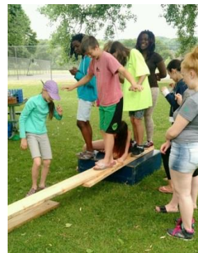
Group team building activity!